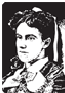
Lottie Moon Christmas Offering